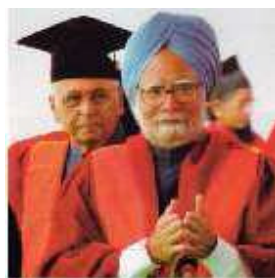
90 th Convocation – 2008 Hon'ble Prime Minister of India Dr. Manmohan Singh