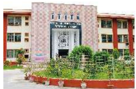
Institute of Medical Sciences