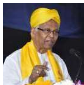
100 th Convocation – 2018 Padma Vibhushan Dr. Raghunath Anant Mashelkar, FRS