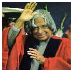
88 th Convocation – 2006 Hon'ble President of India Dr. APJ Abdul Kalam