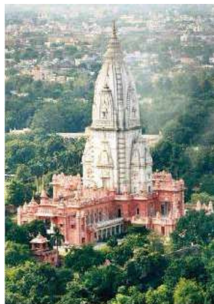
Shri Vishwanath Temple

The Banaras Hindu University has a temple of Lord Shiva called Shri Vishwanath Temple. It is situated at the centre of the campus. The temple is built with white marble. Its detailed planning was done by Malaviya Ji himself. The lush campus of Shri Vishwanath Temple and the beautiful gardens surrounding it are a delight to the eyes of the visitors. The interior of the temple has a Shiva Lingam and verses from Hindu scriptures inscribed on the walls of the temple with pictorial depiction.