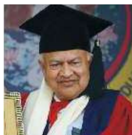
96 th Convocation – 2014 Padma Vibhushan Prof. Jayant Vishnu Narlikar