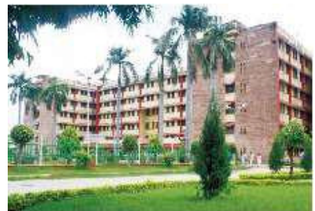
Sir Sunderlal Hospital