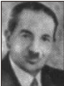
Dr. SHANTI SWARUP BHATNAGAR Eminent Scientist who composed the BHU Kulgeet

So sweet, serene, infinitely beautiful This is the presiding centre of all learning.