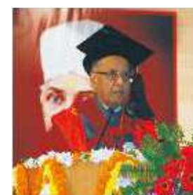
Special Convocation – 2012 Hon'ble President of India Shri Pranab Mukherjee