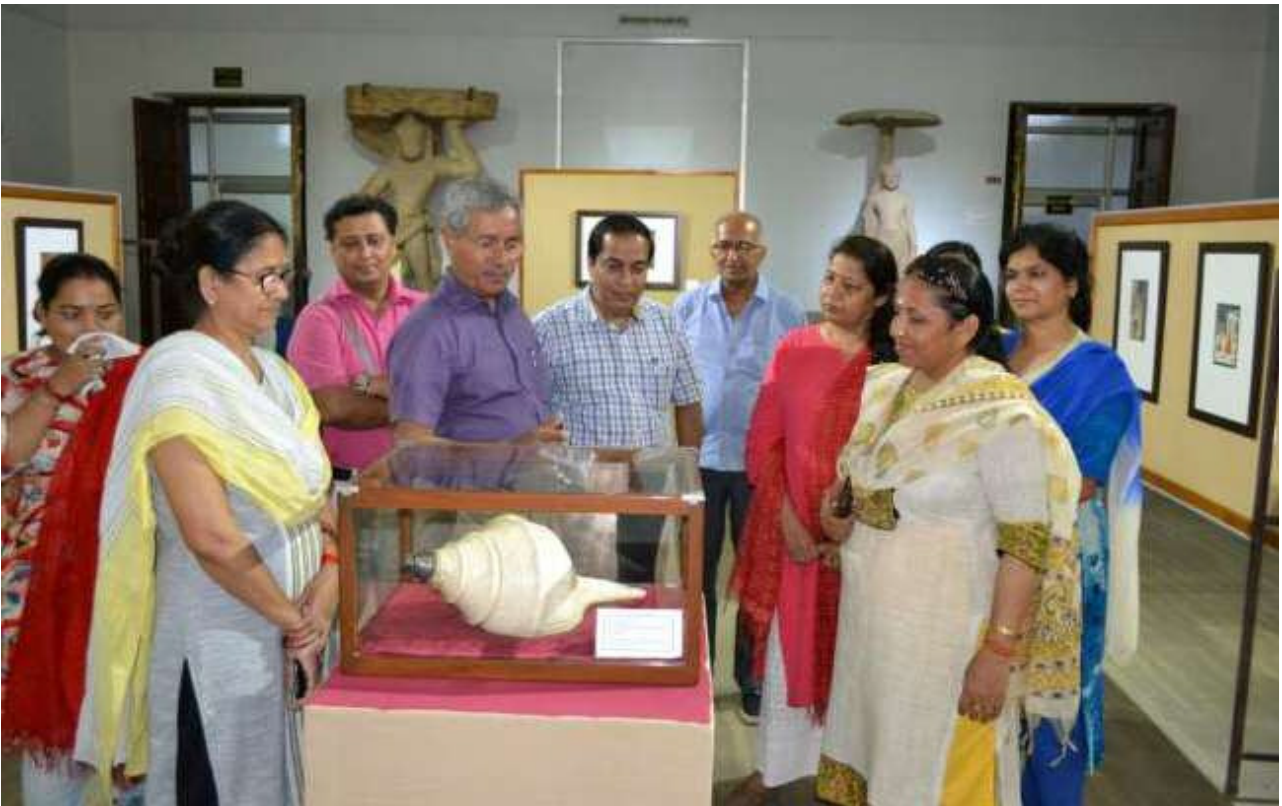
An exhibit "Conch of Tipu Sultan" Displayed on Museum Day at Bharat Kala Bhavan, BHU