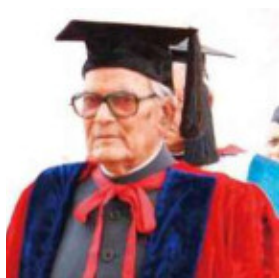
89 th Convocation – 2007 Hon'ble Vice-President of India Shri Bhairon Singh Shekhawat