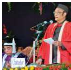
95 th Convocation – 2013 Hon'ble Chancellor of BHU Dr. Karan Singh