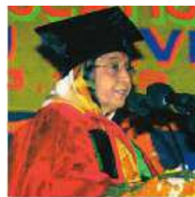
91 st Convocation – 2009 Hon'ble President of India Smt. Pratibha Devi Singh Patil