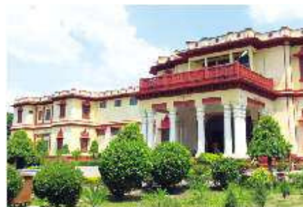
Bharat Kala Bhawan

BHU has a museum of international importance – Bharat Kala Bhawan. This is a treasure trove of rare art and artifacts. The Bharat Kala Bhawan has 13 galleries having a collection of more than 1 lakh antique and rare sculptures, miniature paintings, Rajasthani, Mughal and Pahari paintings, coins, jewellery, precious stones, etc. of immense historic value and a very special literary gallery containing manuscripts of famous authors. It also has a rich library containing rare books.