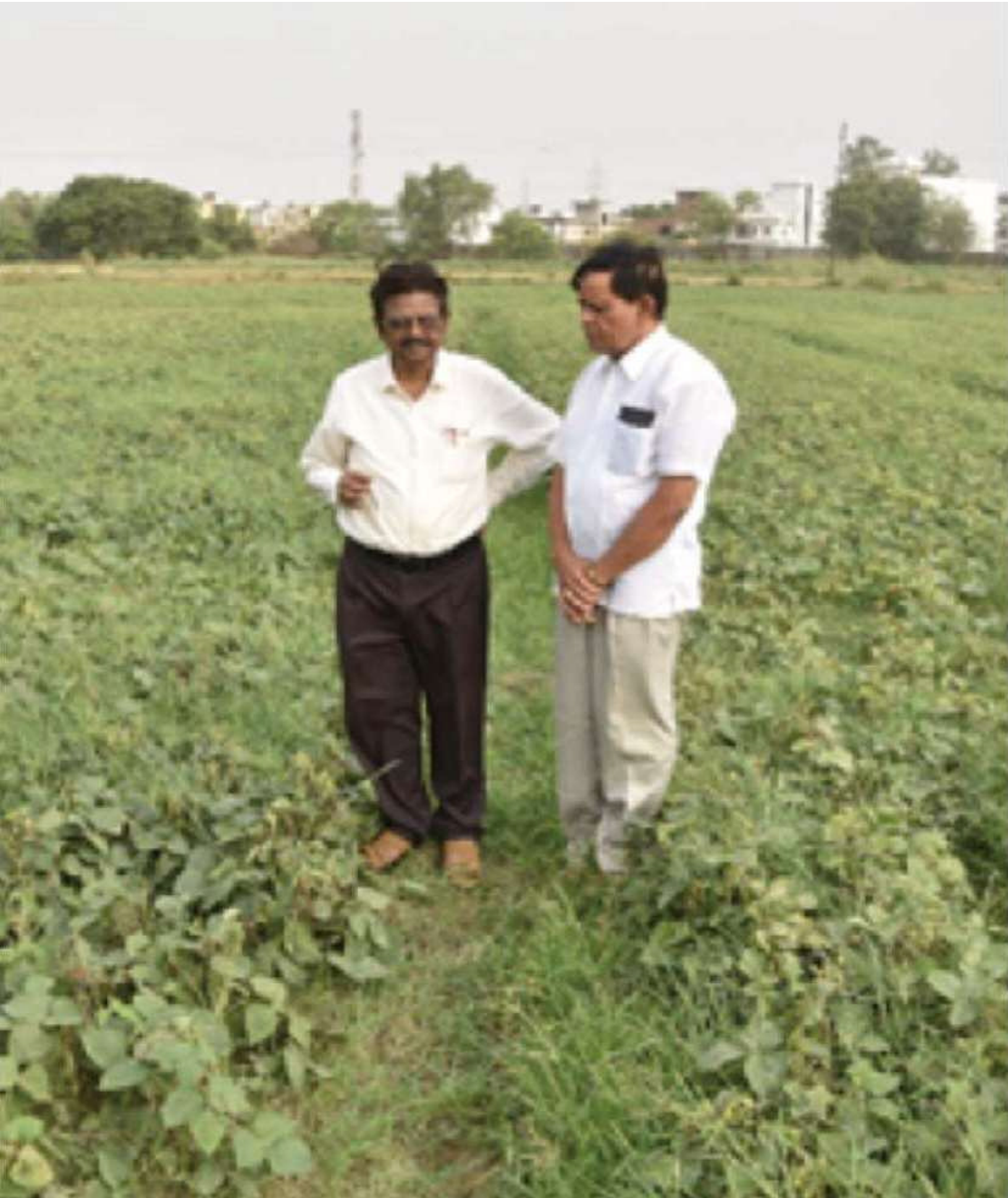
International Training on Quality Seed Production