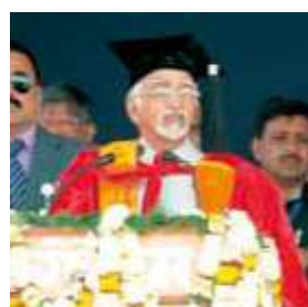
92 nd Convocation – 2010 Hon'ble Vice-President of India Shri Hamid Ansari