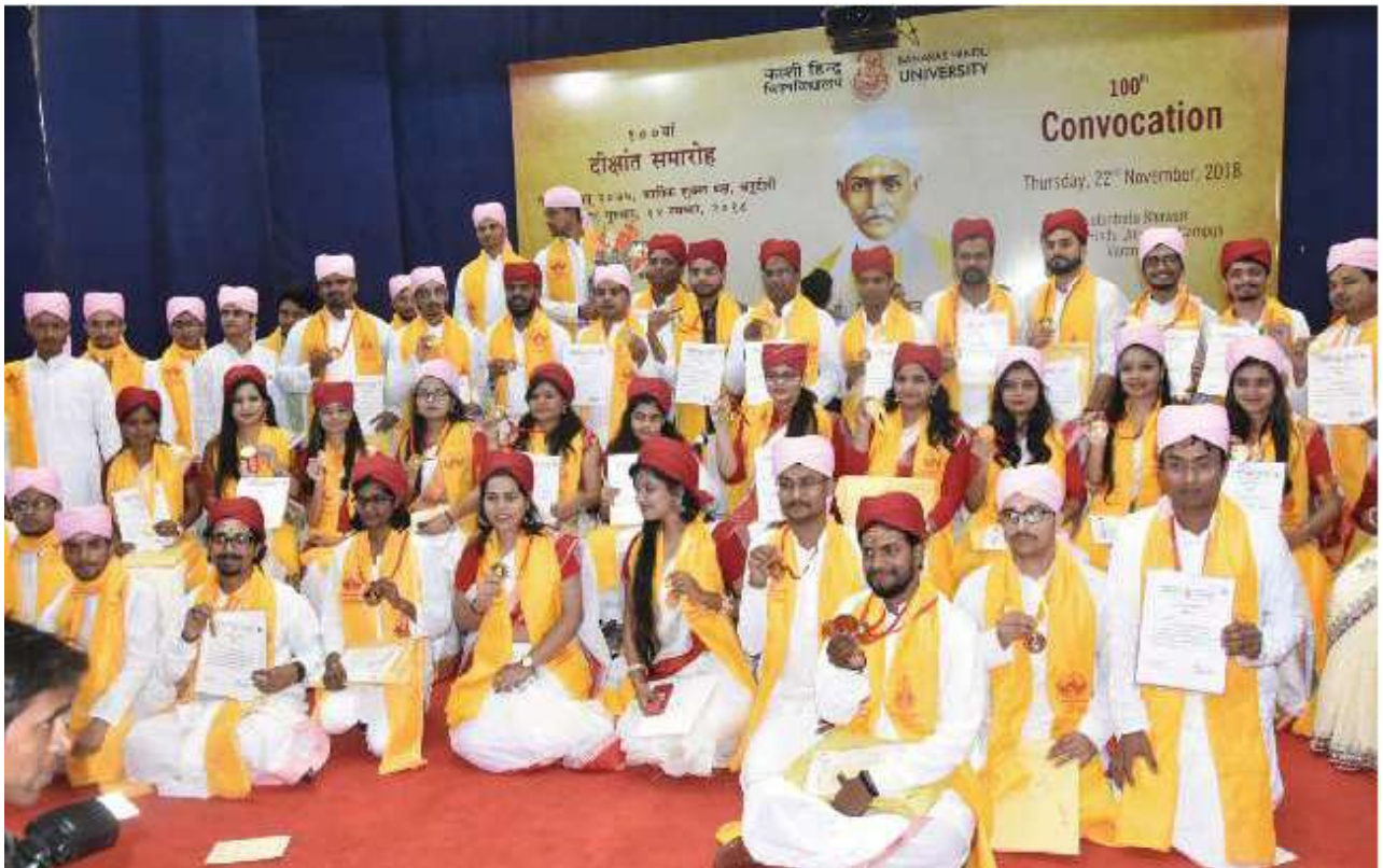
100th Convocation of Banaras Hindu University