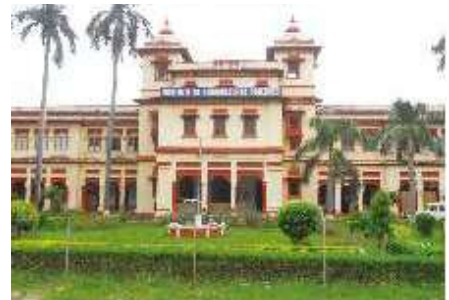
Institute of Agricultural Sciences