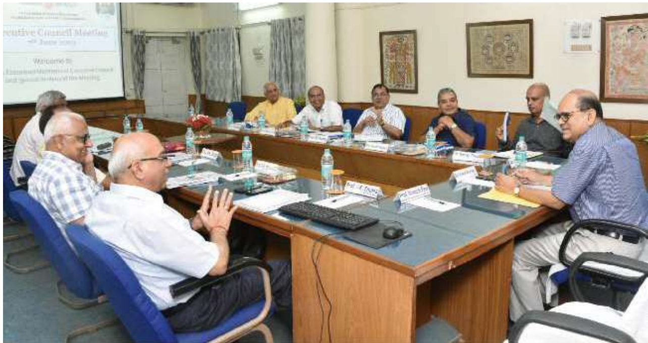
Banaras Hindu University Executive Council Meeting