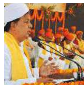
97 th Convocation – 2015 Padma Vibhushan Dr. G. Madhavan Nair