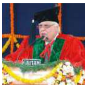
93 rd Convocation – 2011 Hon'ble Minister of HRD Shri Kapil Sibal