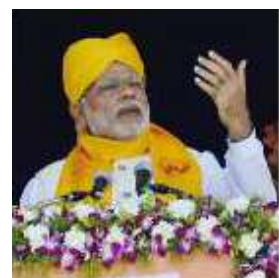
98 th Convocation – 2016 Hon'ble Prime Minister of India Shri Narendra Damodar Das Modi