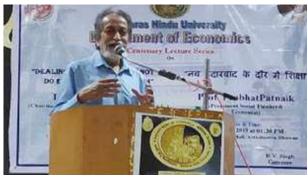
Professor Prabhat Patnayak, JNU delivering lecture in the Department of Economics

several research papers in various National and International conferences and some senior faculty members were invited to deliver keynote speech too. 17 special lectures and EQUILIBRIA were organized by the Department.