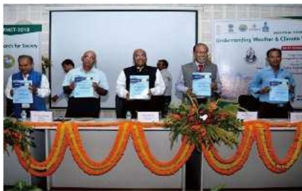
Tropmet-2018: Light Moments during the Conference