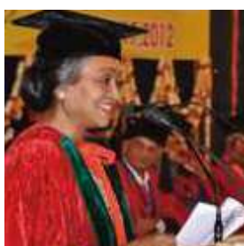
94 th Convocation – 2012 Hon'ble Speaker of Lok Sabha Smt. Meira Kumar