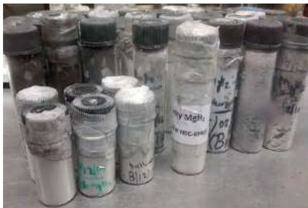
MgH 2 , synthesised at HEC, BHU

During the course of studies on MgH 2 (front running hydrogen storage material), the high cost of