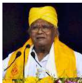
99 th Convocation – 2017 Bharat Ratna Prof. C.N.R. Rao, FRS